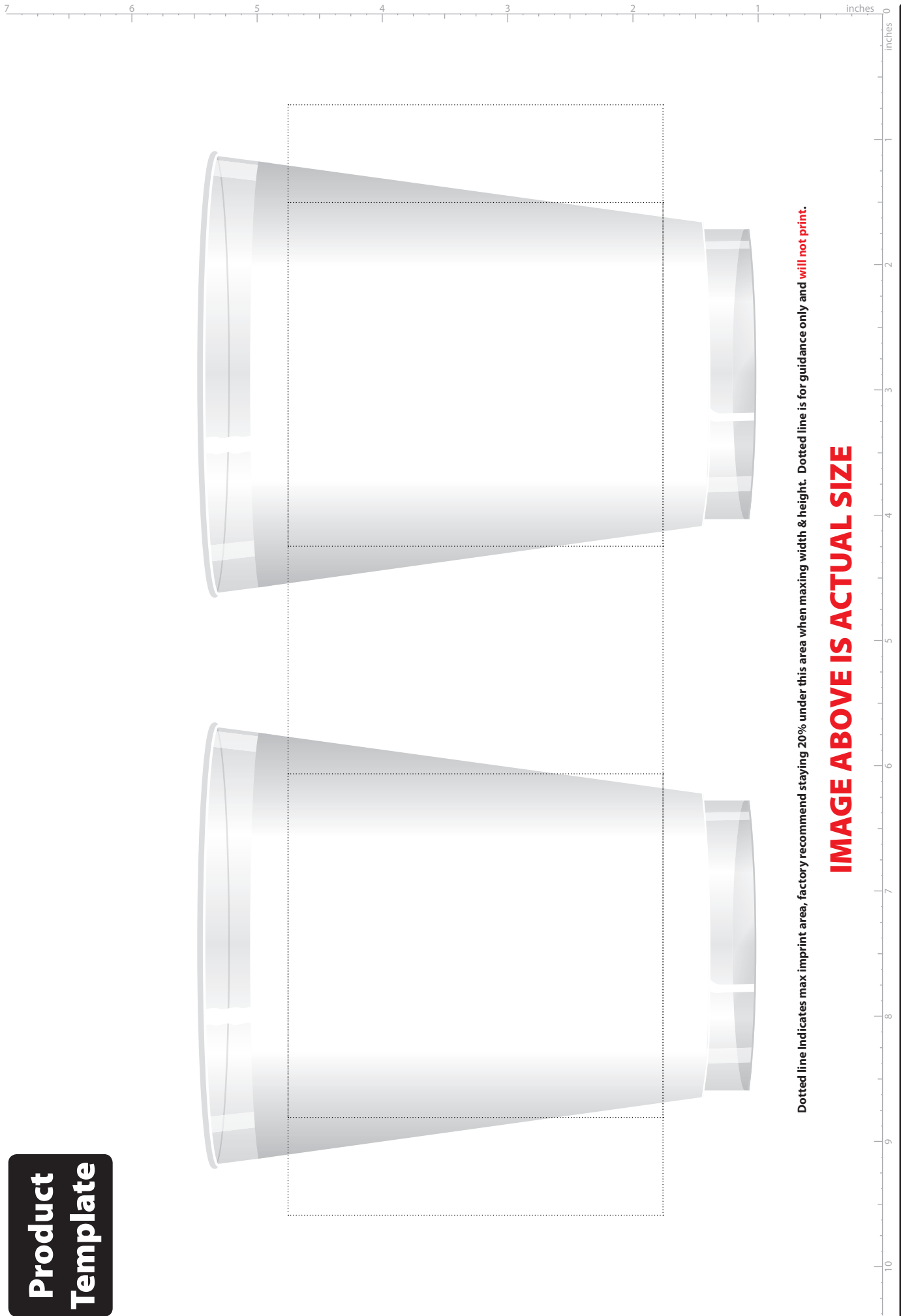
IMAGE ABOVE IS ACTUAL SIZE

Dotted line indicates max imprint area, factory recommend staying 20% under this area when maxing width & height. Dotted line is for guidance only and will not print.